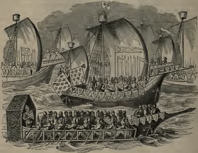
ENGLISH AND FRENCH KNIGHTS UNDER THE DUKE OF BOURBON ON THEIR VOYAGE TO AFRICA. From a MS. Froissart of the fifteenth century.

It was a beautiful sight to view this fleet, with the emblazoned banners of the different lords glittering in the sun and fluttering in the wind; and to hear the minstrels and other musicians sounding their pipes, clarions and trumpets, whose sounds were re-echoed back by the sea. When all were embarked, they cast anchor, and remained that night at the mouth of the harbour; but the servants and horses were left behind on shore. A horse worth fifty francs was on their embarkation sold for ten, as many of the knights and squires were uncertain when, or if ever, they should return, and the keep of five horses at Genoa was upwards of a franc a day: they therefore, on departing, made of them what money they could, but it was little enough.